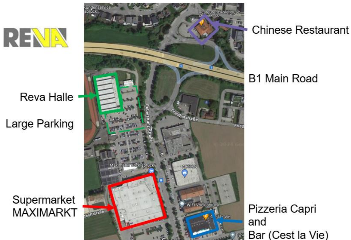
Figure 2: Overview plan of location for EPC25

The Whole Pinball area is placed on the "Ice Hockey" Field as you see in figure 1.